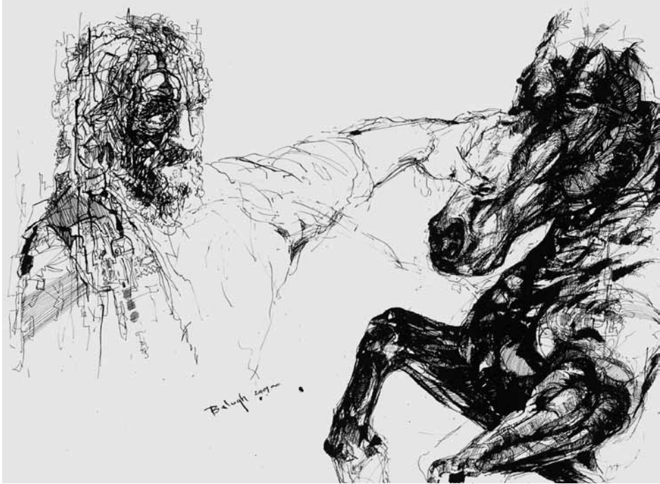
Tibor Balogh: Power Relationships